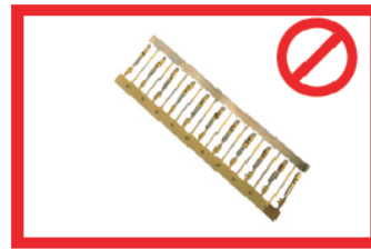
Dual Feed Terminal Strips