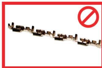
End Feed Terminal Strips